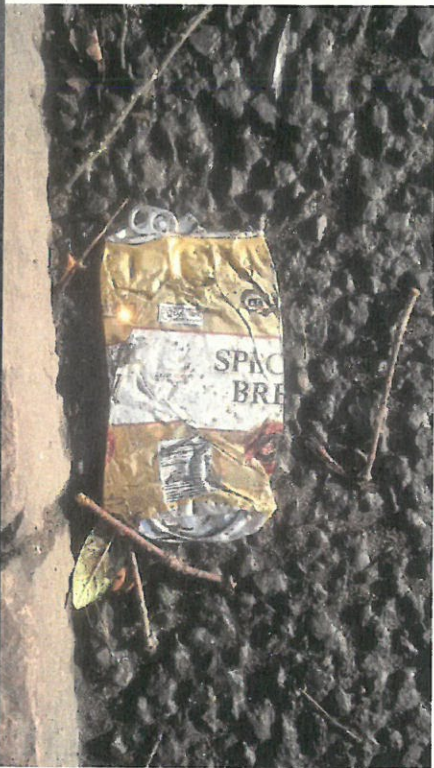
Hartley Road – looking west